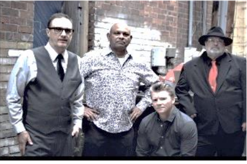
The Bail Jumpers