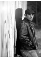
Billy the Kid

The interaction between students, audience and performers was great to see. The students and audience got an introduction to what Blues Music is during the performance part and what it means to the performers during the interviews with Don. All this while also getting an education on what it takes to produce a live show. The musicians got an idea of college life now and what some of the media arts students plan to do after graduation.