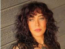
The Love You Bleed